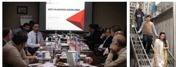
Participants attending the Crisis Management Refresher Training

Stage one (out of three) of 'Anti-kidnapping Measures' lecture was also covered on its side-lines. All CM Team members and their alternates participated whole-heartedly in the training. Interest shown in the training was amply manifested by the exuberance of all, which converted this training into a great interactive learning experience. Narrative-6 of the exercise depicted an earthquake drill. The sight of all the top-management realistically squeezing under the board-room table remained an emblem of realistic touch to the exercise. Subsequently, all staff demonstrated their vigilance during the drill, as they calmly headed to the emergency staircase following upon the standard procedures.