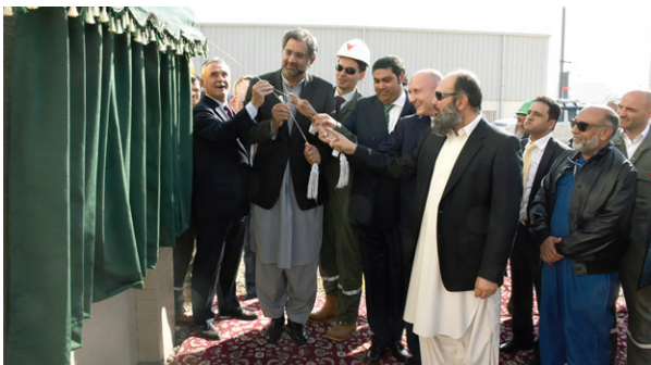
Inauguration of Gas Processing Facility at Makori