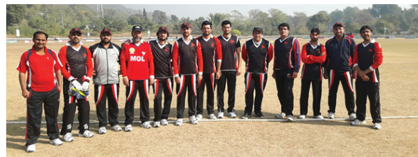
MOL Pakistan Cricket Team

Suspense is now building up for the upcoming week when the two giants MOL Pakistan and Weatherford Int. go head to head at the Shalimar Cricket Ground F-6, in Islamabad, provided the weather conditions are favorable. The Administration Dept. at MOL Pakistan deserves a special round of applause for the overall arrangements, particularly Zaighum Abbas for partaking personal responsibility for the lodging and commute of all players including those joining us from the field. We wish our players the best of luck for the upcoming challenges, hoping that they bring in the Trophy, yet again.